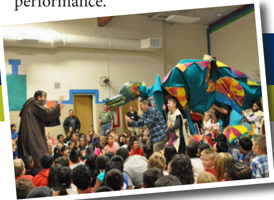
Hawthorne Elementary students and their custodian carry in the Dragon who chases Tamino in OFTY's The Magic Flute

Opera for the Young ® 's Fall Gala will feature a fundraising social followed by a full performance of OFTY's outer space adaptation of Mozart's The Magic Flute . Elementary school students will join OFTY's five professional cast members onstage in Flute as the Alien Council of Wisdom, including three featured student speaking roles as the three-headed Sarastro. Gala guests will see first-hand the magnitude of an Opera for the Young performance.